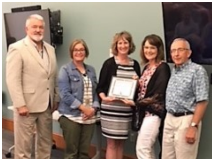
Pictured Left: Central Iowa Community Services receiving the Outstanding Partner Award